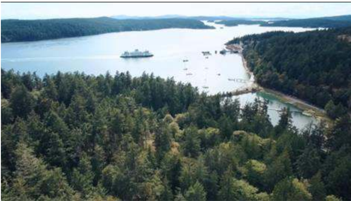
Figure 2. Ferry serving San Juan Islands, WA.

System operations and maintenance were not the only motivating factors, however. Another serious incident that had occurred a few months earlier lent support to OPALCO's decision to enhance communication coverage across the communities it serves. One of the co-op's linemen came into electrical contact with a high-voltage line while working in the field and was seriously burned. Fortunately, the crew was working in an area with just enough cellular coverage that the accident did not result in a fatality. The possibility of a less fortunate outcome in future incidents where communications coverage might be weak or nonexistent was not lost on the cooperative, for which safety is the highest priority.