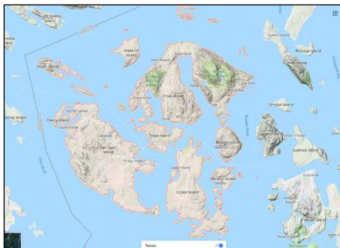
Figure 1. The islands of San Juan County, WA. Map data ©2018 Google

To address these challenges and at the same time enhance its electric operations, OPALCO established a wholly-owned, for-profit subsidiary, Rock Island Communications, to build a broadband communications network that integrates fiber-optic and LTE wireless technology. 1 The network is designed to address public safety needs, support electric system operations, manage outage risks and help the island communities of San Juan County overcome their physical separation from the rest of the state, and their virtual separation from the rest of the world, with scalable, high-speed connectivity. The financial model and deployment methods successfully developed by Rock Island are unique enough (rural isolation, limited broadband service, and seasonal component) that other electric cooperatives with similar characteristics should consider trying to replicate them to raise their odds of success.