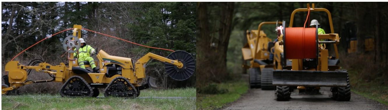
Figure 3. Rock Island Communications personnel pull fiber.

The cooperative also believes that the long-term economic development effects of broadband availability in San Juan County, while not easily quantifiable, will be significant. In recent surveys, 35 percent of seasonal residents (second homes account for roughly 40 percent of the total housing stock in San Juan County) reported spending more time and money in the county as a direct result of improved connectivity – and given the seasonal nature of the county’s economy, stable and reliable services during the compressed, revenue-generating season are a critical issue.