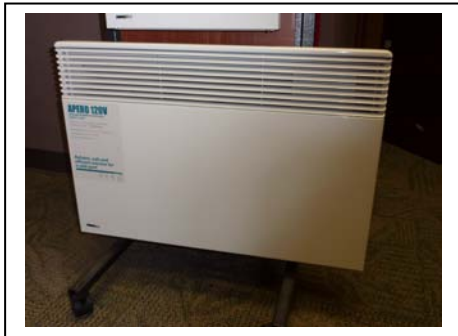
Convectair Wall Heater

Device: Convectair wall heater (120V, 1250w, 60Hz)