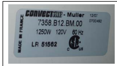
Name plate on the back